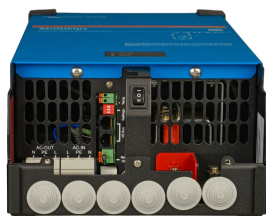
MultiPlus 2000 VA (bottom cover removed)